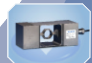
HERMETIC SEALED STAINLESS STEEL LOADCELL