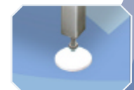
FOOD GRADE FEET WITH MICROBAN PROTECTION